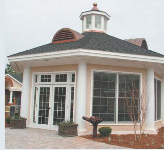
Marie Bott Sanctuary