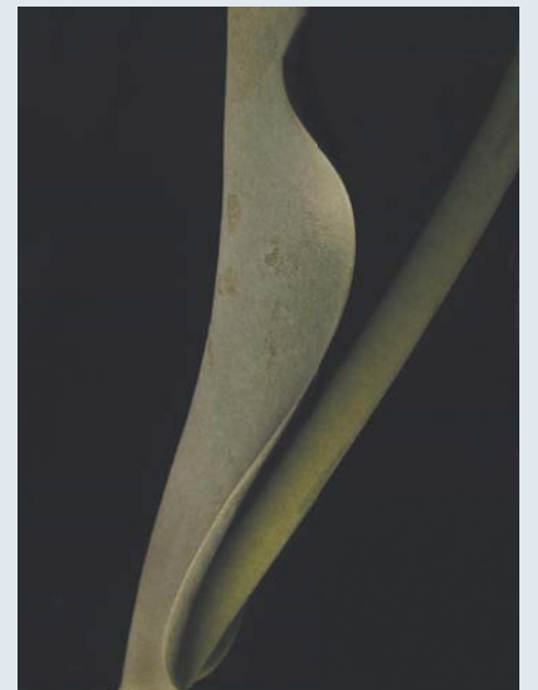
Terry Rouche "Untitled"